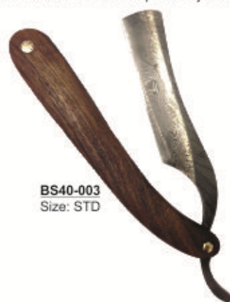
BS40-003 Size: STD