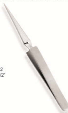
BS36-002 Size: 4 1/2"