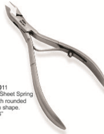
BS35-011 Single Sheet Spring and with rounded smooth shape. SIZE: 4"