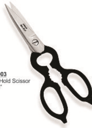
BS32-003 House Hold Scissor Size : 8"