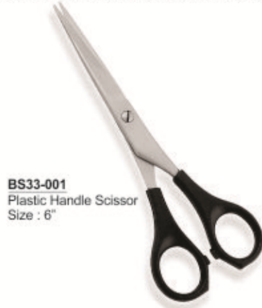
BS33-001 Plastic Handle Scissor Size : 6"

Made from selected steel and crafted to perfection for smooth operation and sharpness with one blade micro serrated and plastic handle makes it good choice in Economy Scissors