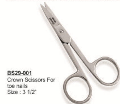
BS29-001 Crown Scissors For toe nails Size : 3 1/2"