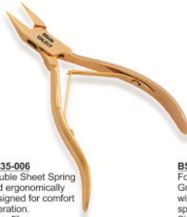
BS35-006 Double Sheet Spring and ergonomically designed for comfort operation. Size: 5"