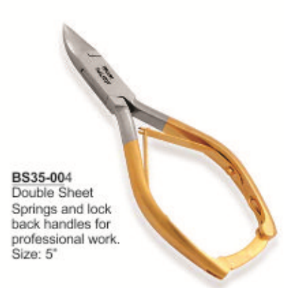
BS35-004 Double Sheet Springs and lock back handles for professional work. Size: 5"