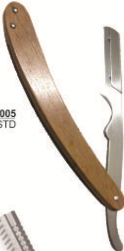
BS39-005 Size: STD