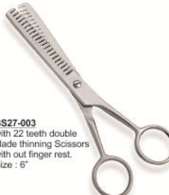
BS27-003 with 22 teeth double blade thinning Scissors with out finger rest. Size : 6"