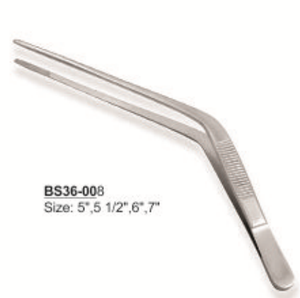
BS36-008 Size: 5", 5 1/2", 6", 7"