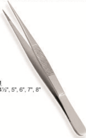
BS36-001 Size: 4", 4 1/2", 5", 6", 7", 8"

The wide body and outside finger serrations make this tweezer fit comfortably in the hand when manipulating components. Made from 300 series Stainless Steel for excellent corrosion resistance.