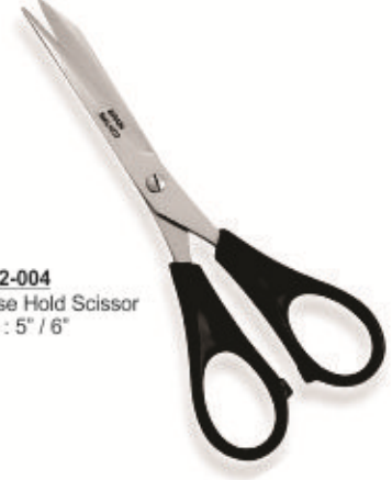
BS32-004 House Hold Scissor Size : 5" / 6"