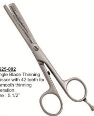
BS25-002 Single Blade Thinning Scissor with 42 teeth for a smooth thinning operation. Size : 5.1/2"