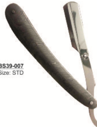
BS39-007 Size: STD