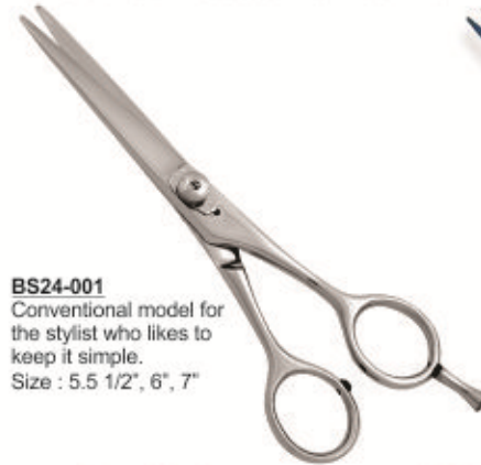
BS24-001 Conventional model for the stylist who likes to keep it simple. Size : 5.5 1/2", 6", 7"

Available in Stainless steel AISI 420 or 440 with hollow ground inner blades and Convex edge