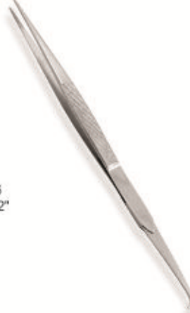
BS36-006 Size: 4 1/2"