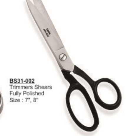
BS31-002 Trimmers Shears Fully Polished Size : 7", 8"