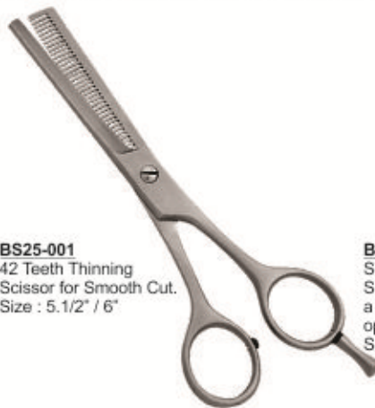
BS25-001 42 Teeth Thinning Scissor for Smooth Cut. Size : 5.1/2" / 6"

Available in Stainless steel AISI 420 or 440 with hollow ground inner blades and Convex edge