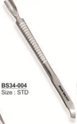
BS34-004 Size : STD