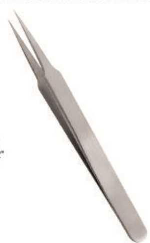
BS36-004 Size: 5 1/2"