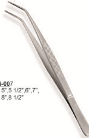
BS36-007 Size: 5", 5 1/2", 6", 7", 8", 8 1/2"