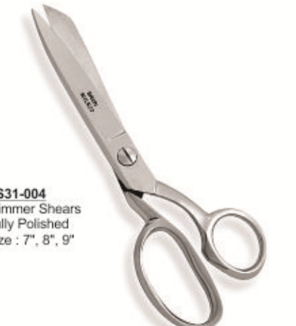
BS31-004 Trimmer Shears Fully Polished Size : 7", 8", 9"