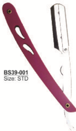
BS39-001 Size: STD

Double Edge Shaving Razors Made of steelness Steel, Available in vast verity, all steel or in hard plastic handel. We also can produce your razor according to your requirements.