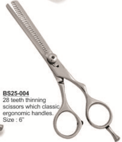
BS25-004 28 teeth thinning scissors which classic ergonomic handles. Size : 6"