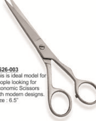
BS26-003 This is ideal model for people looking for Economic Scissors with modern designs. Size : 6.5"