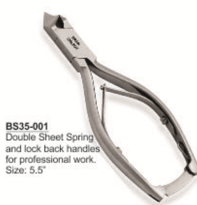
BS35-001 Double Sheet Spring and lock back handles for professional work. Size: 5.5"

Forged from Surgical Grade Stainless Steel with Box Joint, Single Sheet Spring and finished to perfection