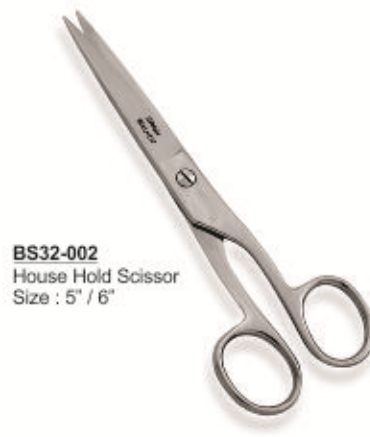
BS32-002 House Hold Scissor Size : 5" / 6"