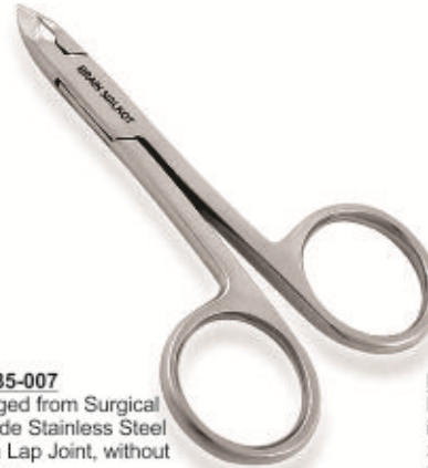
BS35-007 Forged from Surgical Grade Stainless Steel with Lap Joint, without spring Size: 4"