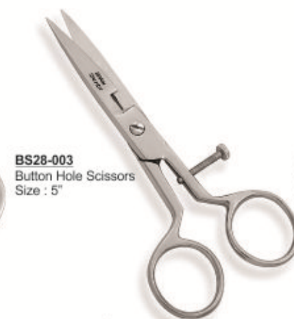
BS28-003 Button Hole Scissors Size : 5"