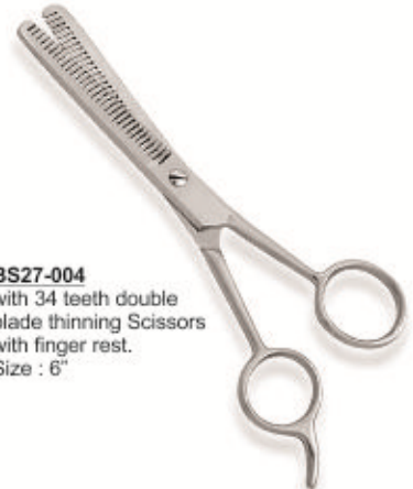
BS27-004 with 34 teeth double blade thinning Scissors with finger rest. Size : 6"