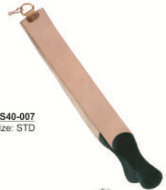
BS40-007 Size: STD