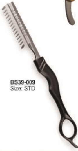
BS39-009 Size: STD