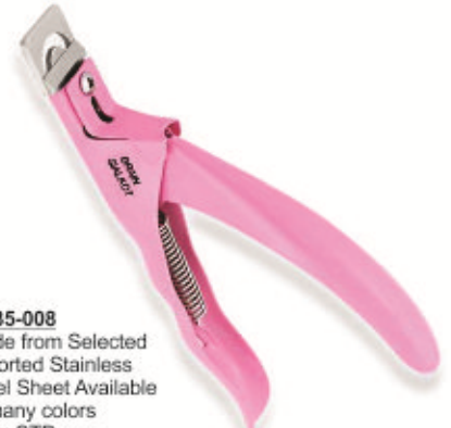
BS35-008 Made from Selected imported Stainless Steel Sheet Available in many colors Size: STD