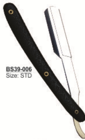
BS39-006 Size: STD