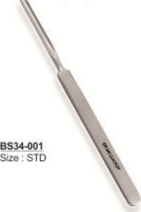
BS34-001 Size : STD

Made from surgical grade stainless steel, easy to sterilize in hot water to be use again n again for professional purpose.