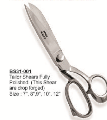
BS31-001 Tailor Shears Fully Polished. (This Shear are drop forged) Size : 7", 8", 9", 10", 12"