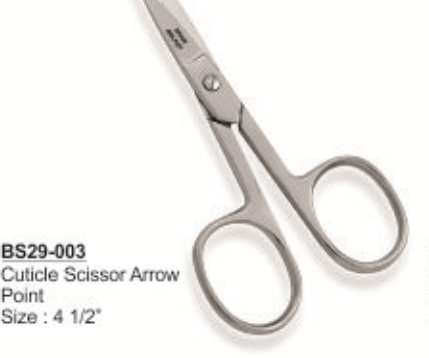
BS29-003 Cuticle Scissor Arrow Point Size : 4 1/2"