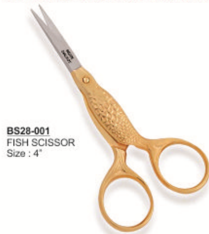
BS28-001 FISH SCISSOR Size : 4"