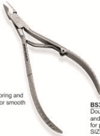
BS35-009 Single Wire Spring and light handles for smooth operations. Size: 5"