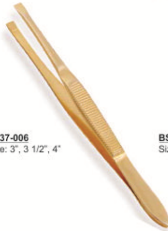
BS37-006 Size: 3", 3 1/2", 4"