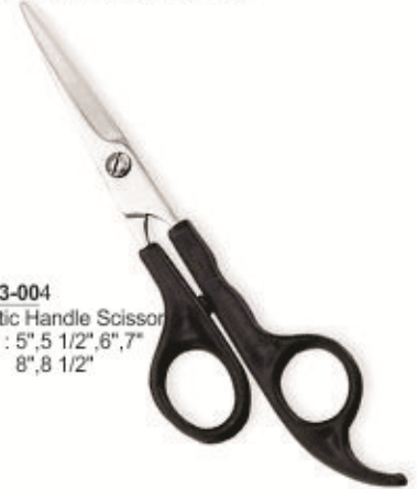
BS33-004 Plastic Handle Scissor Size : 5", 5 1/2", 6", 7", 8", 8 1/2"