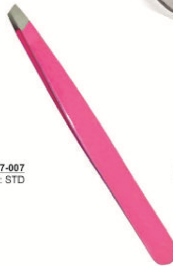
BS37-007 Size: STD