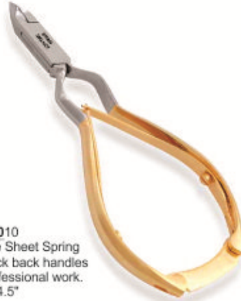
BS35-010 Double Sheet Spring and lock back handles for professional work. SIZE: 4.5"