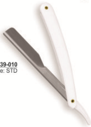
BS39-010 Size: STD