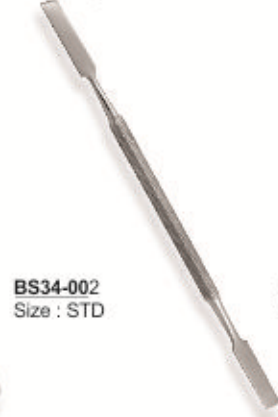
BS34-002 Size : STD