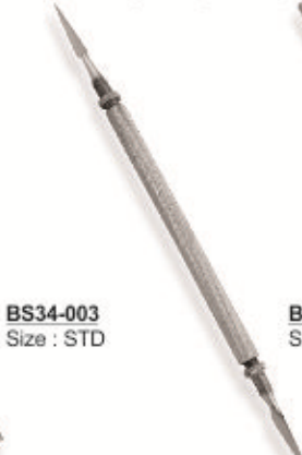
BS34-003 Size : STD