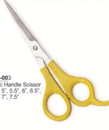
BS33-003 Plastic Handle Scissor Size : 5", 5.5", 6", 6.5", 7", 7.5"