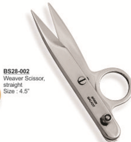
BS28-002 Weaver Scissor, straight Size : 4.5"