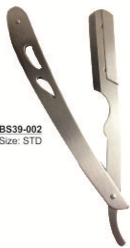
BS39-002 Size: STD