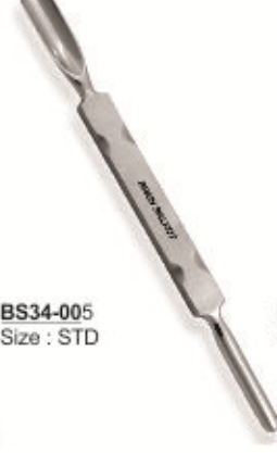
BS34-005 Size : STD