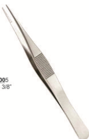
BS36-005 Size: 4 3/8"