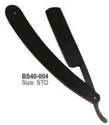
BS40-004 Size: STD