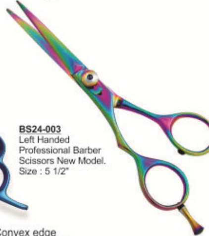
BS24-003 Left Handed Professional Barber Scissors New Model. Size : 5 1/2"