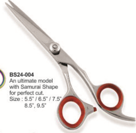
BS24-004 An ultimate model with Samurai Shape for perfect cut. Size : 5.5" / 6.5" / 7.5" 8.5", 9.5"