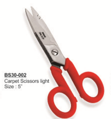
BS30-002 Carpet Scissors light Size : 5"