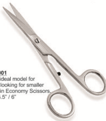
BS26-001 This is ideal model for people looking for smaller blades in Economy Scissors. Size : 5.5" / 6"

Made from selected steel and crafted to perfection for smooth operation and sharpness with one blade micro serrated