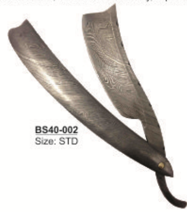
BS40-002 Size: STD