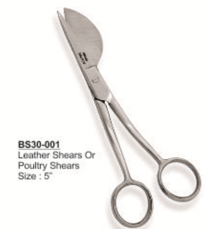
BS30-001 Leather Shears Or Poultry Shears Size : 5"