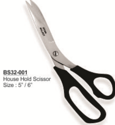
BS32-001 House Hold Scissor Size : 5" / 6"