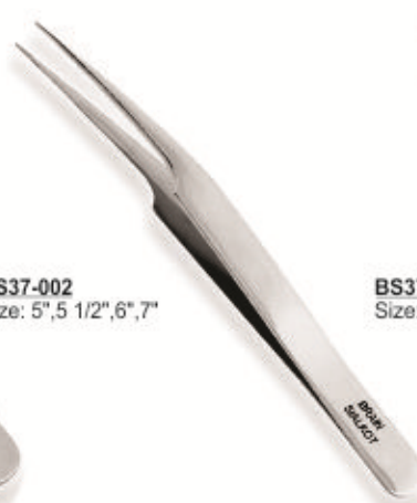
BS37-002 Size: 5", 5 1/2", 6", 7"