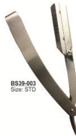
BS39-003 Size: STD