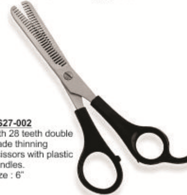
BS27-002 with 28 teeth double blade thinning Scissors with plastic handles. Size : 6"