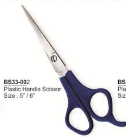
BS33-002 Plastic Handle Scissor Size : 5" / 6"