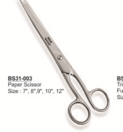
BS31-003 Paper Scissor Size : 7", 8", 9", 10", 12"