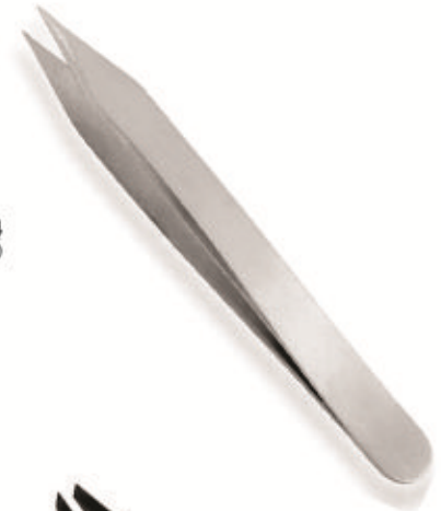
BS37-004 Size: STD