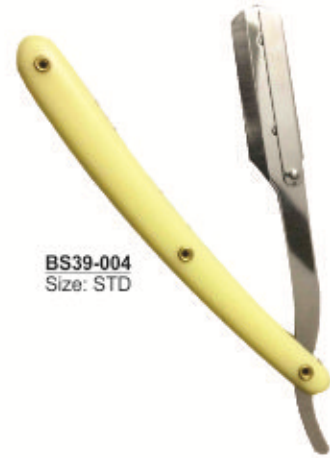
BS39-004 Size: STD