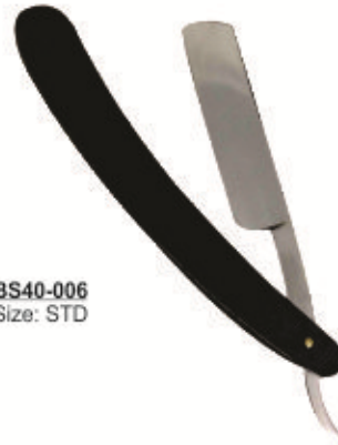
BS40-006 Size: STD