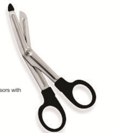
BS30-004 Utility Scissors with Plastic Size : 6"