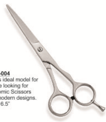
BS26-004 This is ideal model for people looking for Economic Scissors with modern designs. Size : 6.5"