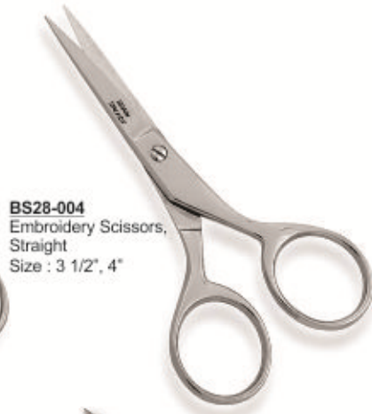
BS28-004 Embroidery Scissors, Straight Size : 3 1/2", 4"