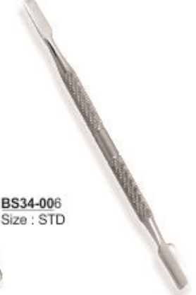
BS34-006 Size : STD