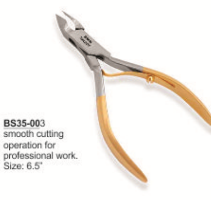
BS35-003 smooth cutting operation for professional work. Size: 6.5"