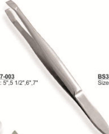
BS37-003 Size: 5", 5 1/2", 6", 7"