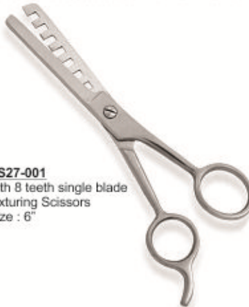
BS27-001 with 8 teeth single blade texturing Scissors Size : 6"

Made From Selected Steel And Machined To Perfection For Smooth Thinning Operation