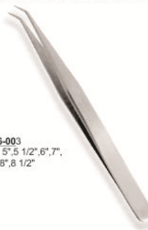
BS36-003 Size: 5", 5 1/2", 6", 7", 8", 8 1/2"