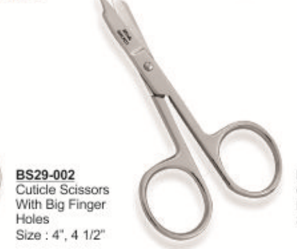
BS29-002 Cuticle Scissors With Big Finger Holes Size : 4", 4 1/2"