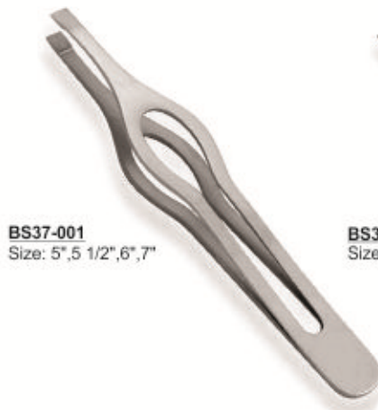
BS37-001 Size: 5", 5 1/2", 6", 7"

Made from selected stainless steel sheet and can be supplied in Gold plating, Mirror Polish, Satin, Dark Satin and Color coating of many shades.