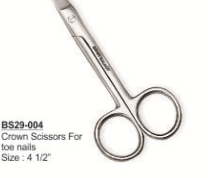
BS29-004 Crown Scissors For toe nails Size : 4 1/2"