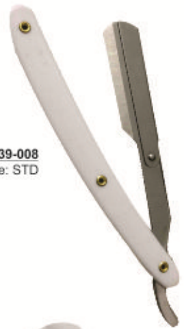
BS39-008 Size: STD