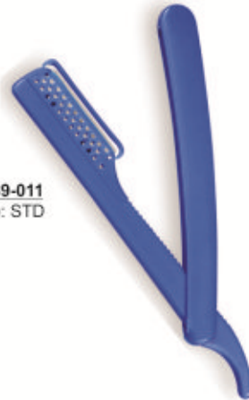
BS39-011 Size: STD