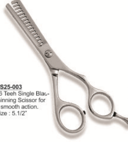
BS25-003 16 Teeth Single Blade thinning Scissor for a smooth action. Size : 5.1/2"