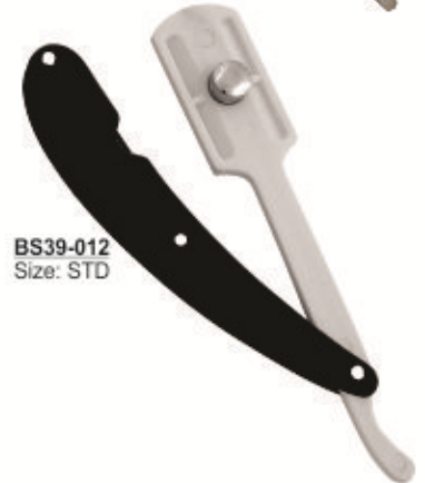
BS39-012 Size: STD