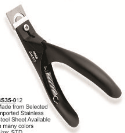
BS35-012 Made from Selected imported Stainless Steel Sheet Available in many colors Size: STD