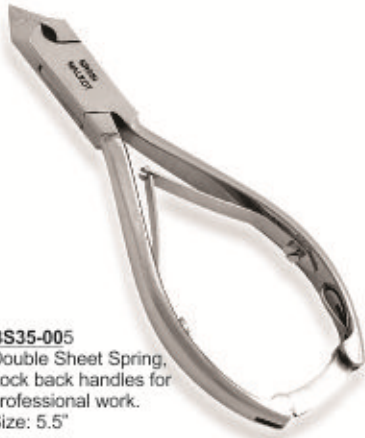
BS35-005 Double Sheet Spring, Lock back handles for professional work. Size: 5.5"