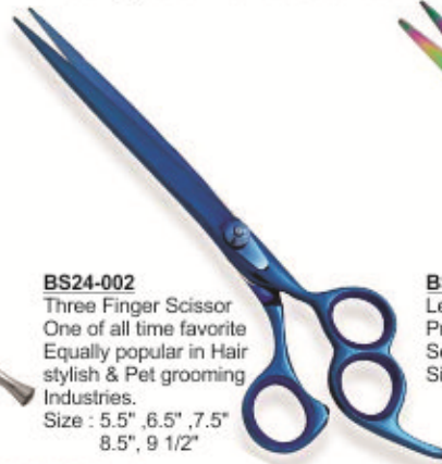
BS24-002 Three Finger Scissor One of all time favorite Equally popular in Hair stylish & Pet grooming Industries. Size : 5.5", 6.5", 7.5" 8.5", 9 1/2"