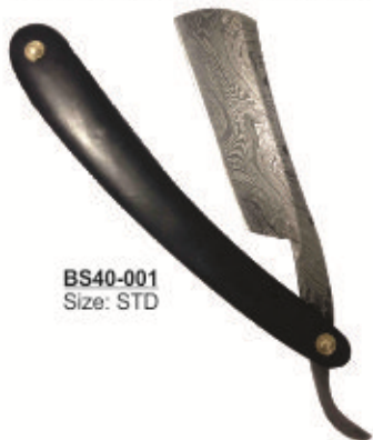
BS40-001 Size: STD

Straight Shaving Razors Made of Damascus Steel and Steelness Steel, Available in vast verity, Imported Wood handle. We also can produce your razor according to your requirements.