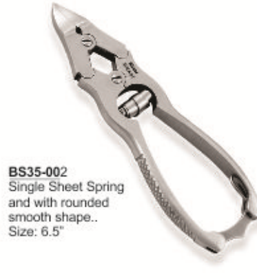
BS35-002 Single Sheet Spring and with rounded smooth shape.. Size: 6.5"