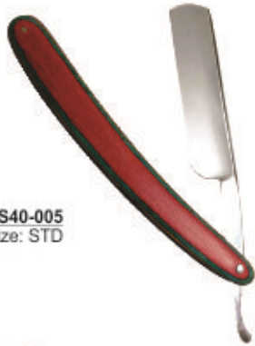
BS40-005 Size: STD