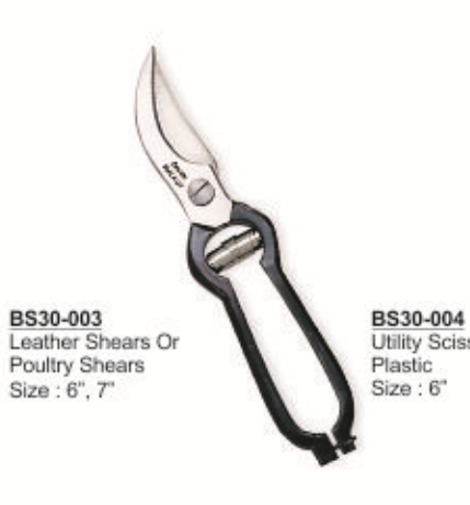
BS30-003 Leather Shears Or Poultry Shears Size : 6", 7"