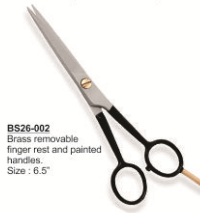
BS26-002 Brass removable finger rest and painted handles. Size : 6.5"