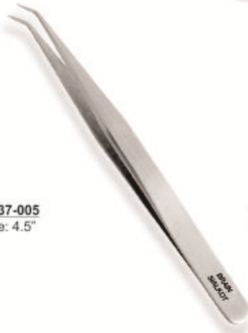
BS37-005 Size: 4.5"